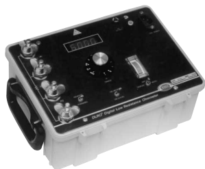
The Low-Range DLRO, Cat. No. 247002, features an extra range and rugged, Single-Pak design.