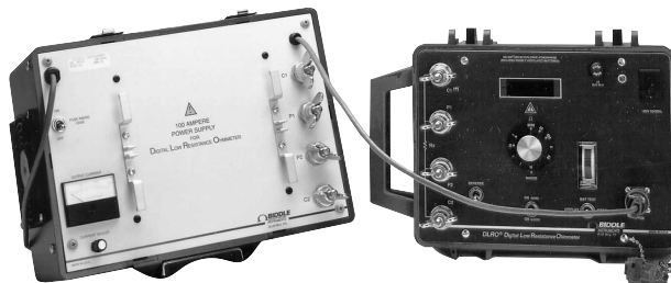
Low-Range/High-Current Model Cat. No. 247101 consists of a Single-Pak DLRO, Cat. No. 247001-3, and separate 100 ampere test current supply, Cat. No. 247120. The 100 ampere supply also may be ordered as an option.