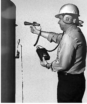
Locating a leak in an air pressure tank