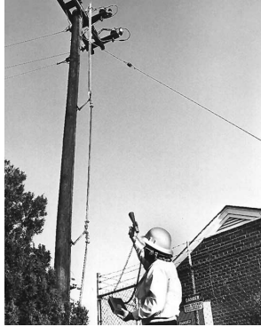
The detector is excellent for patrolling pole lines.