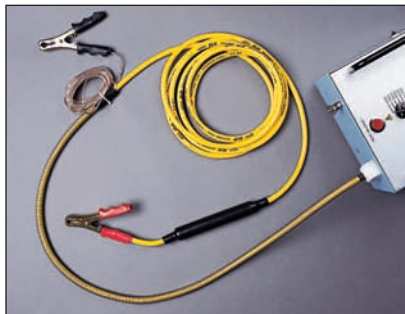
Permanently mounted cable set and ground cable