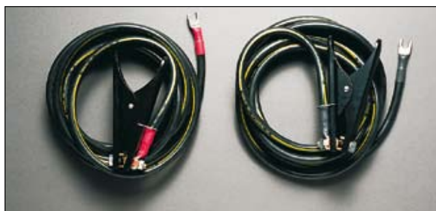
Cable set GA-05052