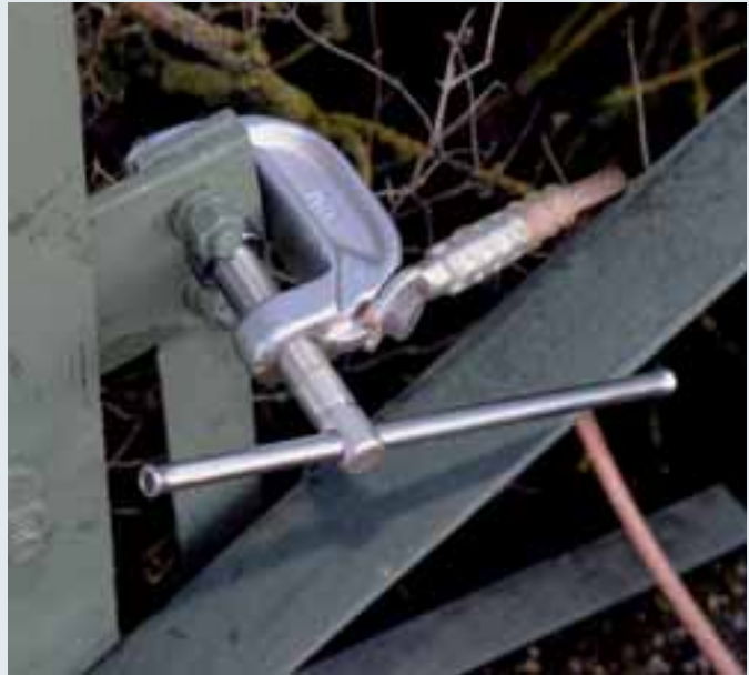
Earth milling clamp used for coated steel masts.