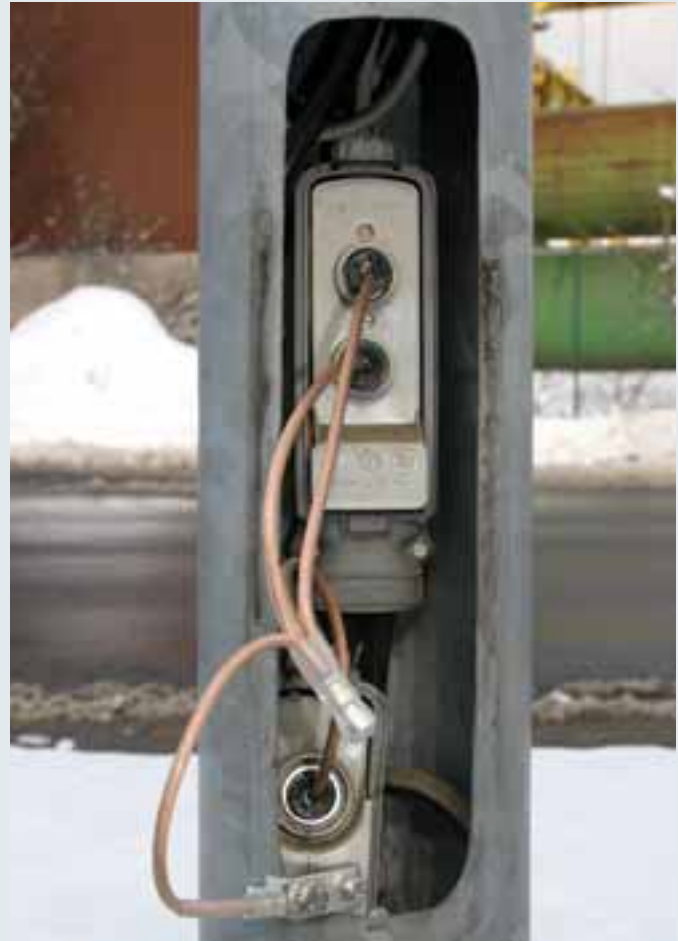
Earthing and short-circuiting device installed at a junction and fuse box of a street lighting mast.