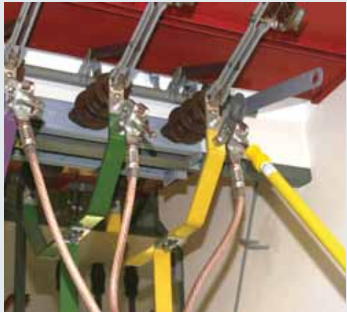
Earthing rod for attaching an earthing and short-circuiting device to an installation.

Earthing rods are portable insulating rods for approaching the connecting components of earthing and short-circuiting devices to parts of electrical power installations for earthing and short-circuiting purposes. They consist of an insulating part, black ring, handle and coupling for attaching connecting components. Earthing rods have to be selected according to the weight of the earthing and short-circuiting device (see also "max. load on the operating head in kg"). The insulating part is the part of the earthing rod between the black ring and the end of the earthing rod in the direction of the connecting component. It provides the user with the necessary safety distance and sufficient insulation. The insulating part must have a minimum length of 500 mm.