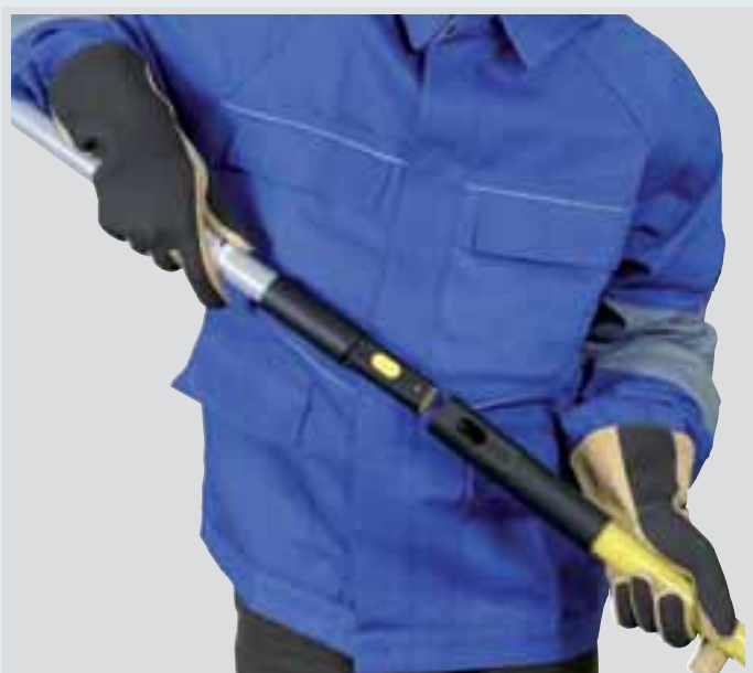
The plug-in coupling allows for easy handle extension of ES STK earthing rods.

Earthing rods with bayonet locking mechanism (T pin shaft) can also be used for clamps with hexagon shaft if an AES SQ SK adapter is used.