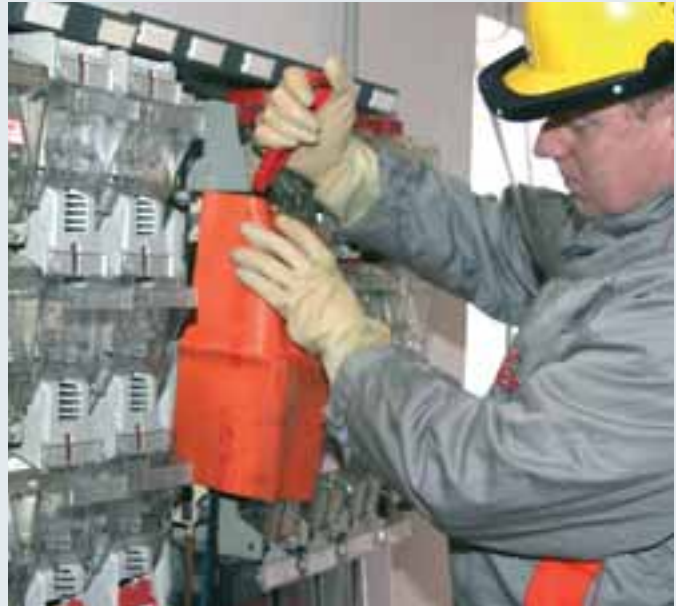
Live working with insulated gloves up to 1000 V.