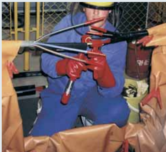
Covering of live parts.