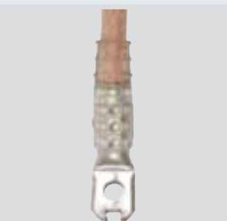
Crimped cable lugs, PK1 type: Standard cable lug with cut-out for protection against twisting.