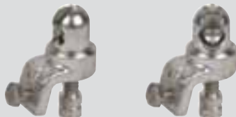
Adjustable ball head cap (4 x 90°)