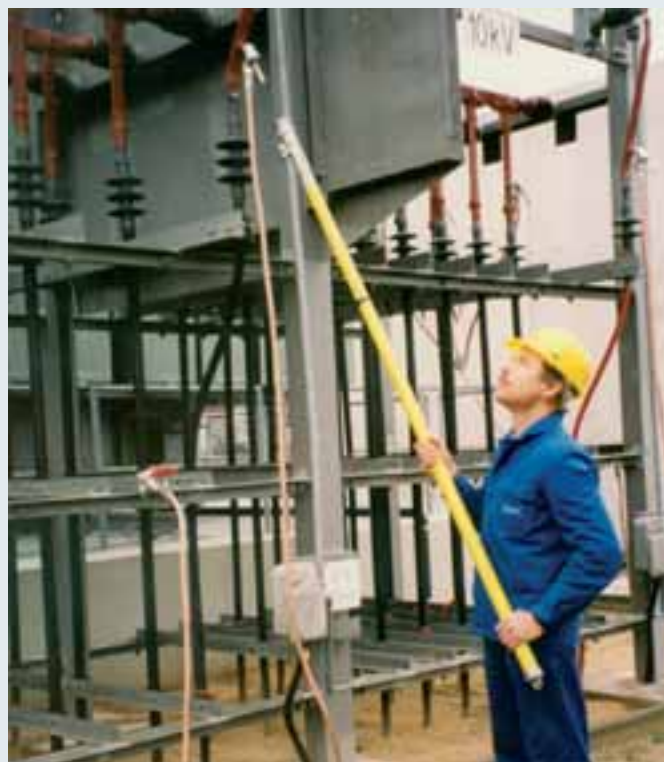
Rigid ball head cap with long shaft and earthing rod.

*) Clamping range and maximum cable cross section for universal clamps at: