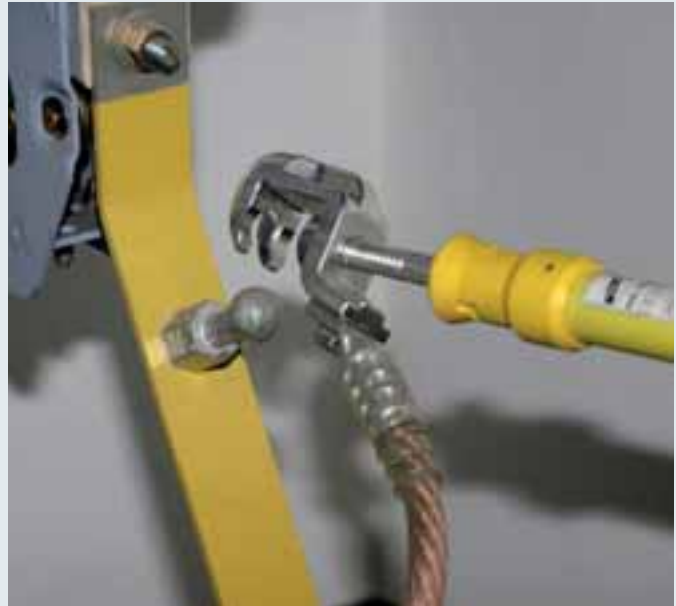
Connecting the universal clamp to a fixed ball point.