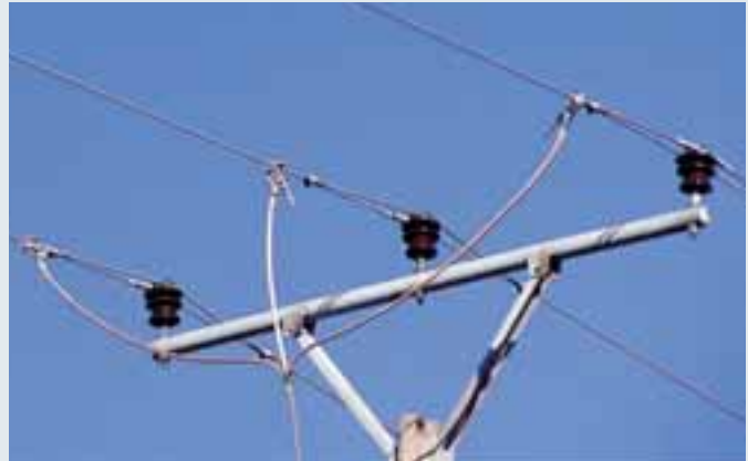
Phase screw clamps used on an overhead line.

EN/IEC 61230 (DIN VDE 0683 Part 100) Threaded T pin shaft DIN 48087