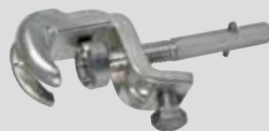
SQ: T pin shaft (bayonet locking mechanism)