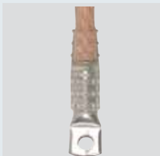
Crimped cable lugs, PK2 type: Standard cable lug without cut-out which can be connected to components from other manufacturers. Only available on request.