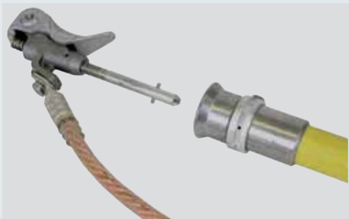
Clamp with long shaft and earthing rod with aluminium cone coupling.