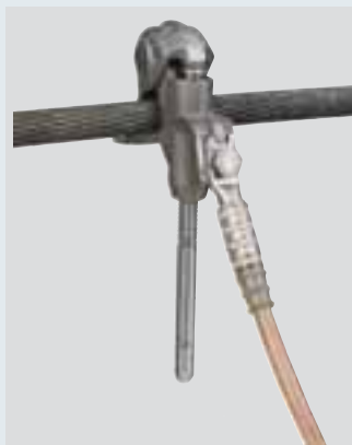
Phase screw clamp with spring tension