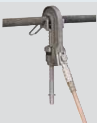
Phase screw clamp with fixed coupling aid for safe coupling