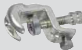
SK: Hexagon shaft