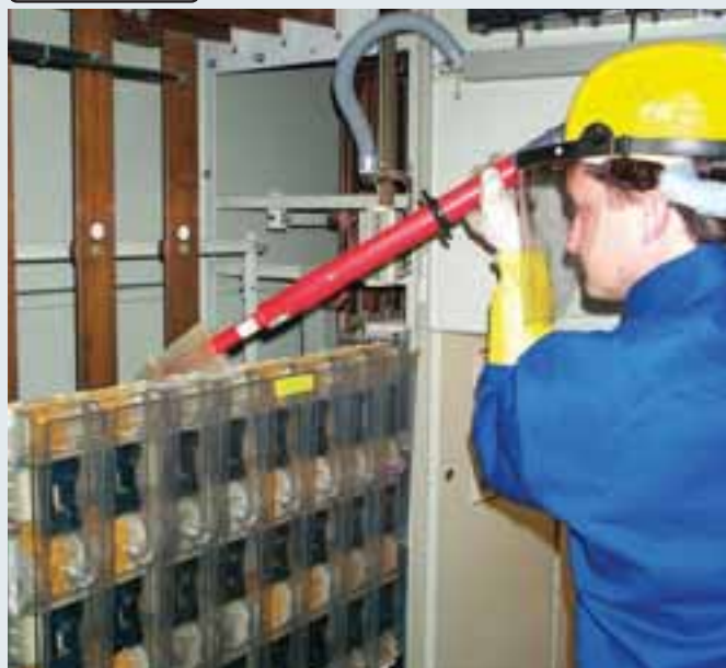
Live cleaning of a low-voltage switchgear installation using the TRS NS dry cleaning kit