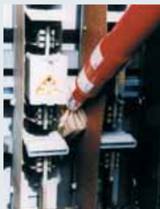
Tubular brush in use.