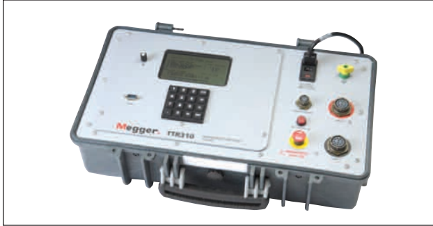
TTR310 — text-based LCD interface unit