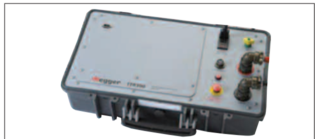
TTR300 — remote controlled “black box” unit