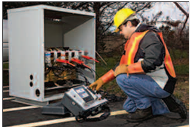
TTR330 shown testing a pad mount three-phase transformer