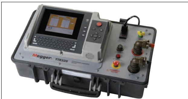
TTR320 — graphical ICON based user interface unit

The TTR320 features a high contrast bright 5.7" full VGA color display can be seen in direct sunlight. The instrument employs a full QWERTY keyboard for entering nameplate-type information. Communications ports are provided in the form of RS-232, USB and Ethernet ports for easy on-board printing, storage, and downloading of test results.